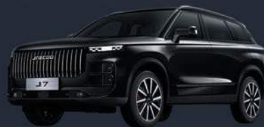
Carbon Crystal Black